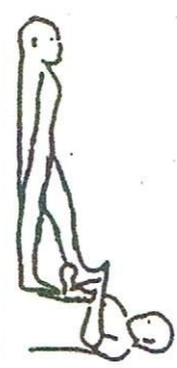
BRAGGARD'S & FAJERSZTAJIN'S TEST (affected leg) (well leg)