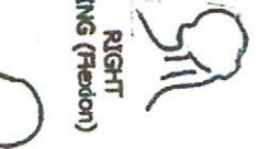
RIGHT LATERAL BENDING (Flexion)