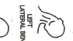
LEFT LATERAL BENDING (Flexion)