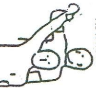
HYPERABDUCTION (Wright's Test)